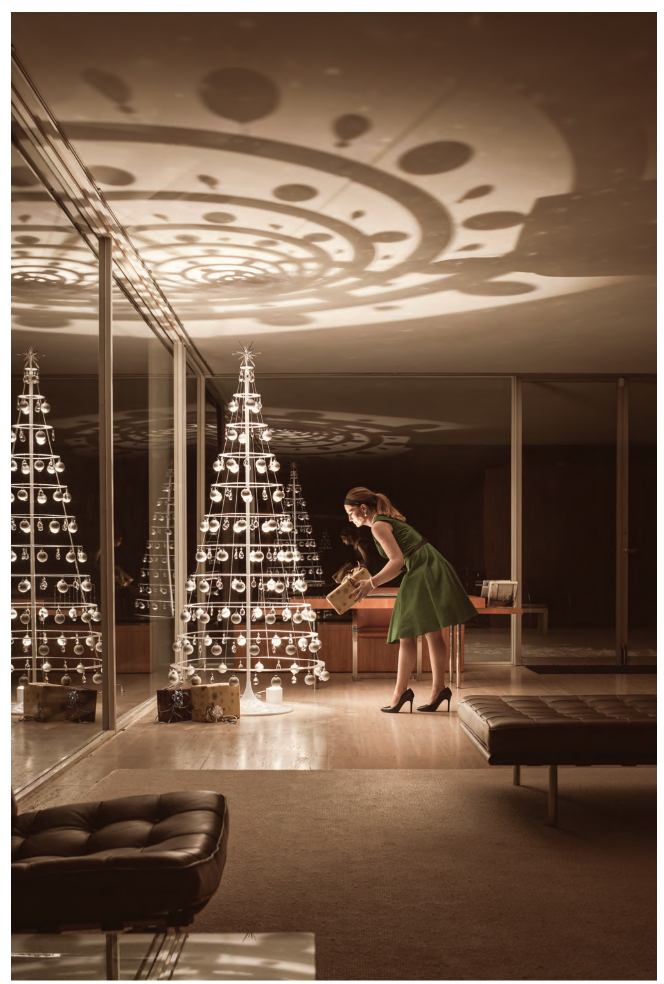
The\ Modern\ Christmas\ Tree\ inside\ the\ iconic\ Farnsworth\ House,\ Plano,\ Illinois.