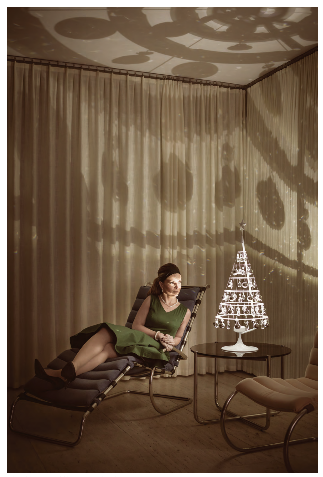
The \ Jubilee \ Tree \ available \ at \ www. Modern Christmas Tree. com/shop